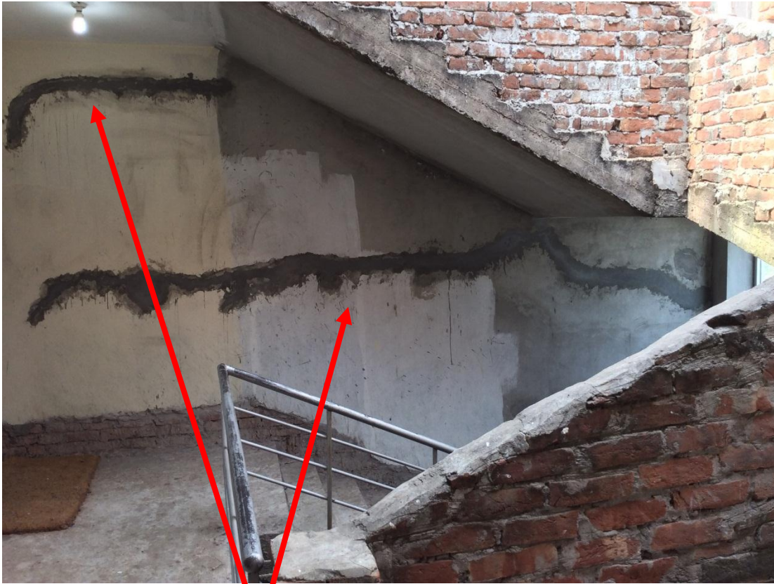
Cracking in outer brick wall.