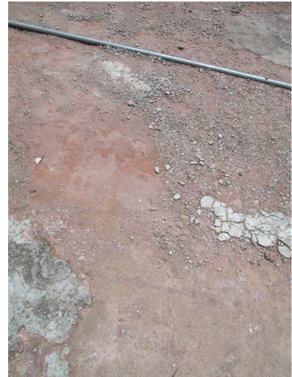
Damaged water proofing material at roof.