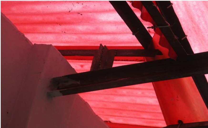
Poor connection with brick wall and roof shed..

Poor connection between roof shed and brick column. (Wastage Godown and workshop)