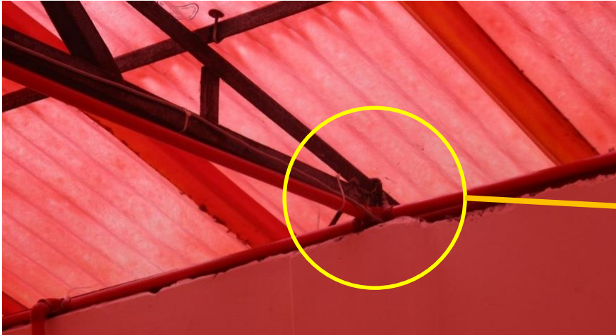
Poor connection with brick wall and roof shed..