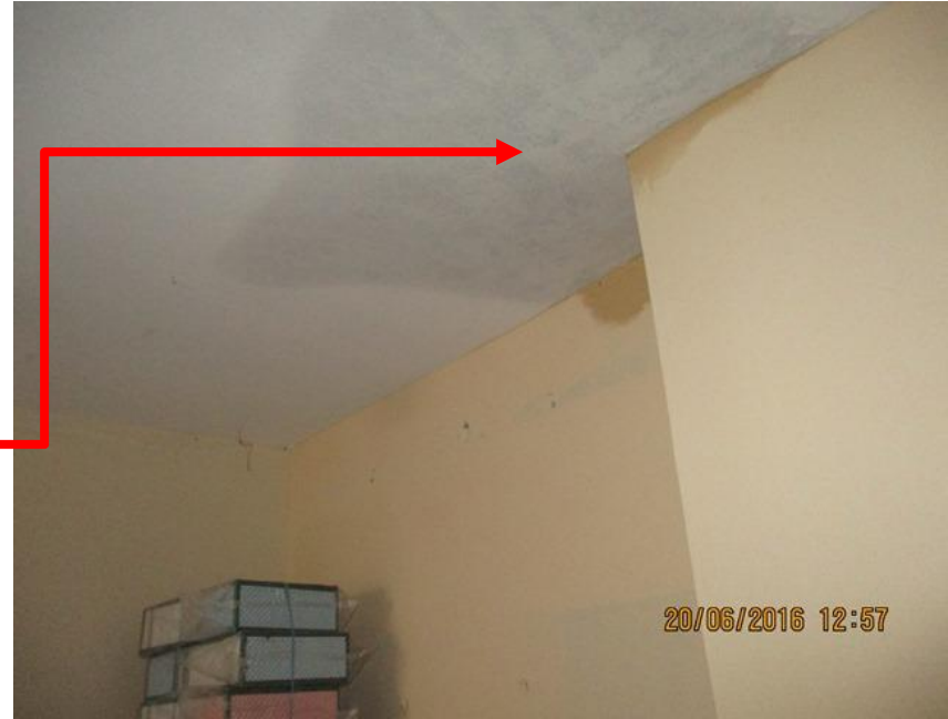
Dampness observed at GF floor slab under toilet area.