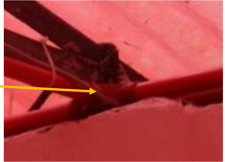
Improper connection was found between roof shed and wall.