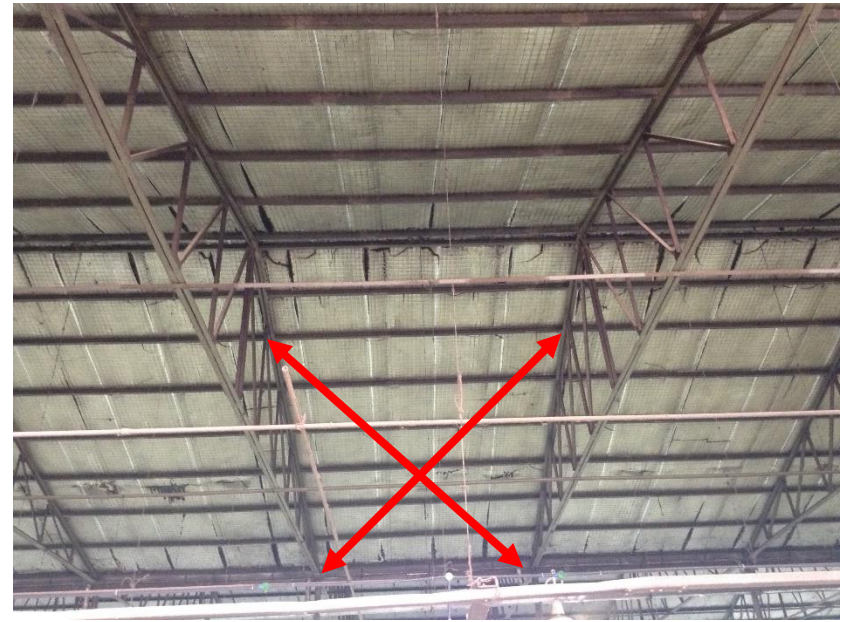
Lack of Vertical and Horizontal Bracing on Main Production Shed