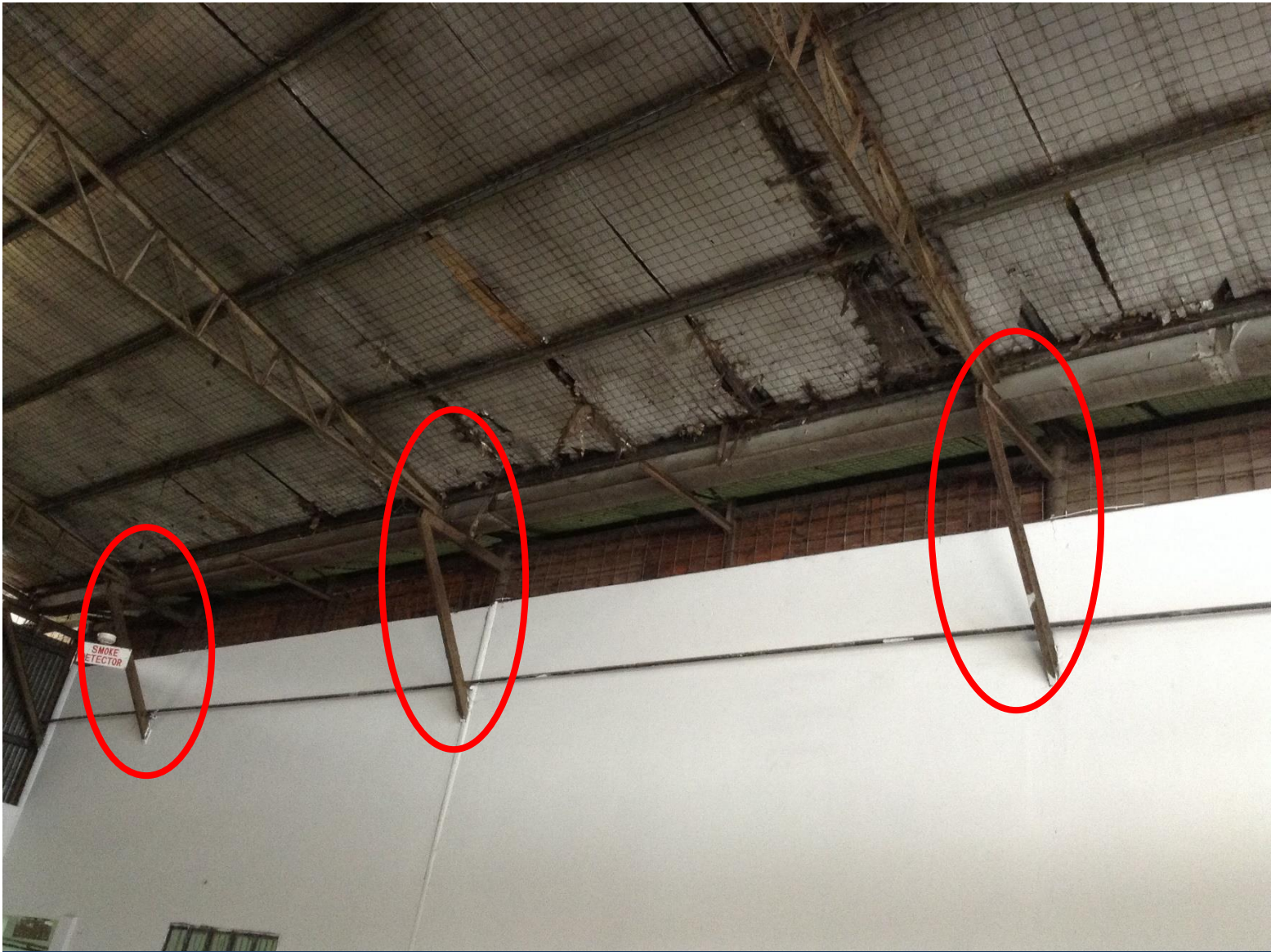
Non-Engineered Connection of Roof Truss in Warehouse