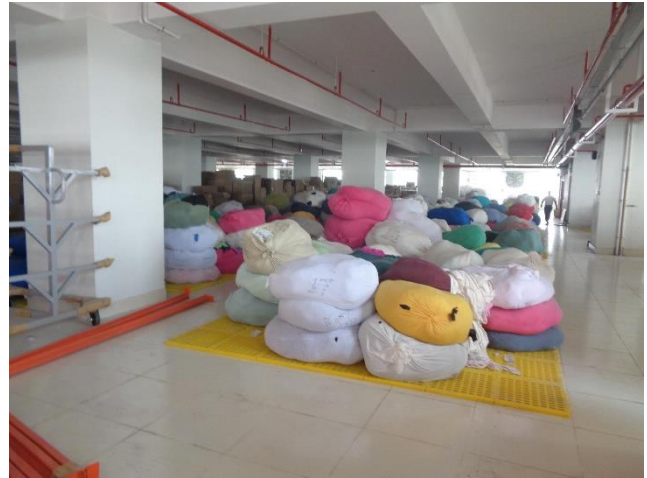
Typical floor loading

Description: The cursory calculation indicates that the column is stressed above the normal design limit at the marked location considering the floor live load as per the provided load plan (6 kPa for the typical floor and roof). We have considered minimum concrete strength based on aggregate type due to inadequate number of concrete cylinder test reports and rebar strength 500 MPa from the available rebar test report. The building engineer is required to review design and column stresses based on in-situ concrete strength at the marked location. Also, produce and actively manage load management plans.