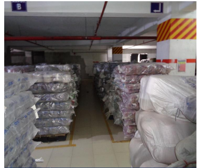
Typical storage area-4 th floor

Live load at storage areas are considered as 4 KPa in prepared load plan. However, as per BNBC the live load for light storage area is required to be considered as 6 KPa. Factory engineer is required to revise the load plan as per BNBC.