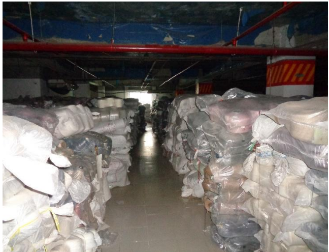
Typical storage area-1 st floor