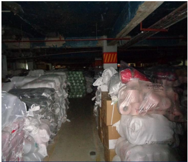
Typical storage area-1 st floor