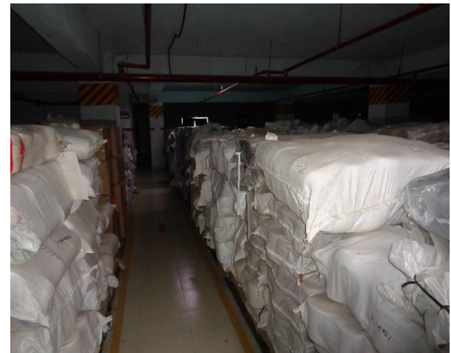
Typical storage area-4 th floor