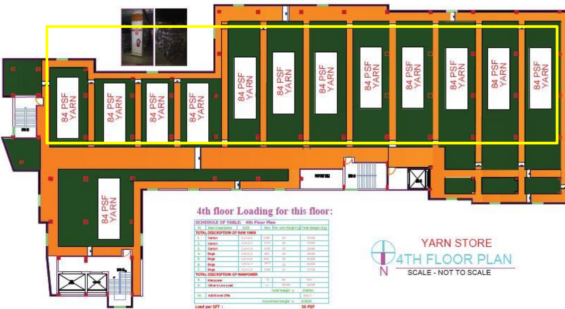
Load plan for 4 th floor (Yarn store-4KPa)