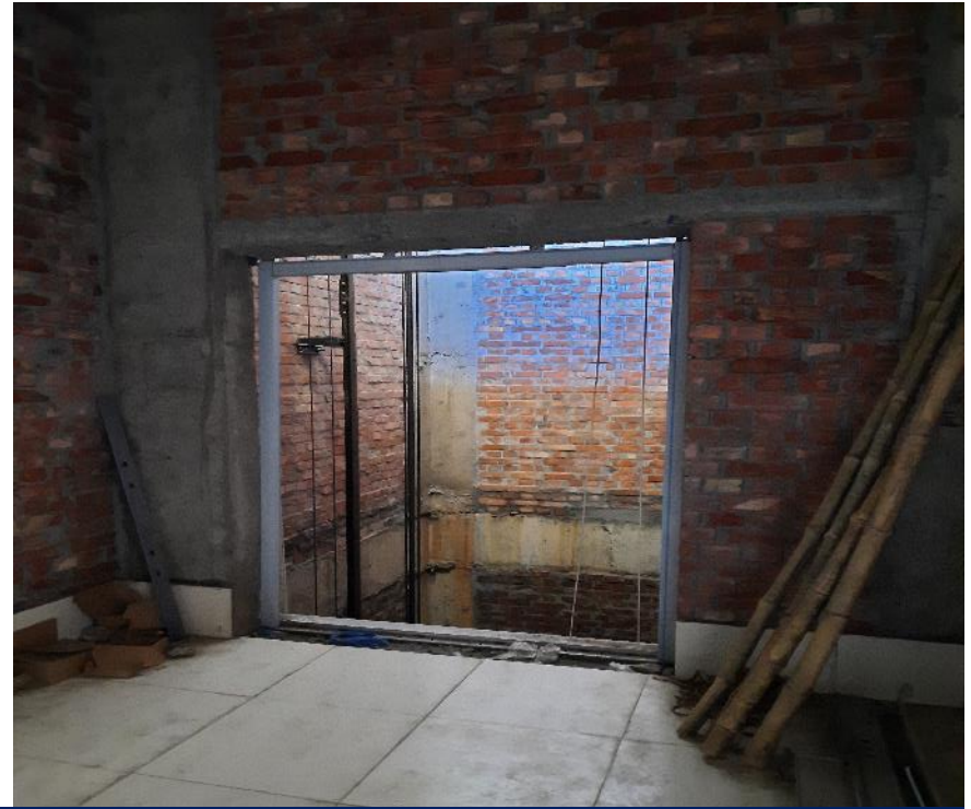
No guardrails around the lift core