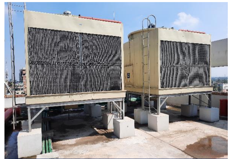
Cooling tower with build ups