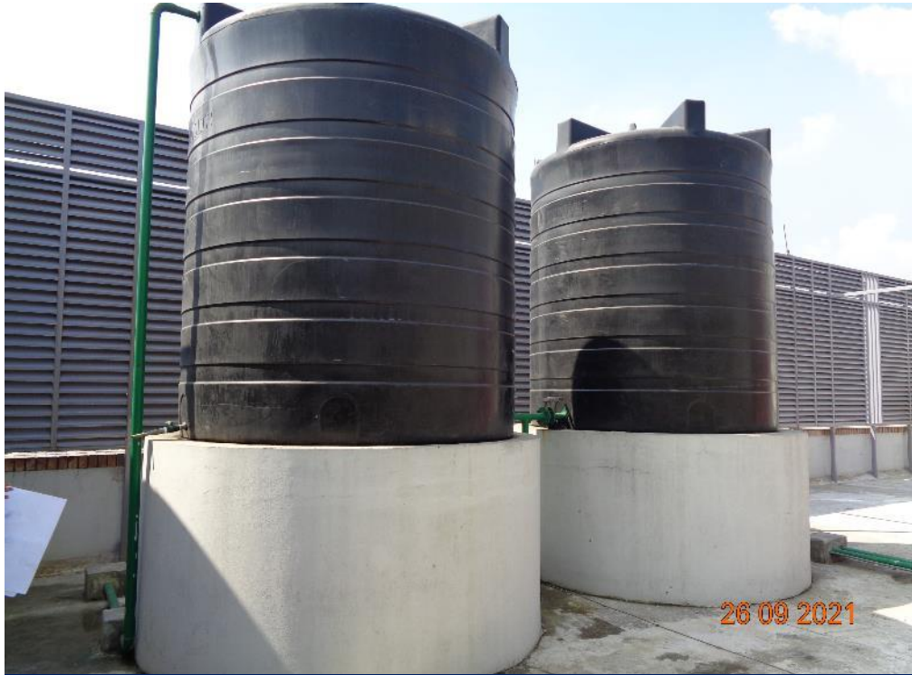
10,000-liter water tanks with 1.3 m buildup

Water tank and cooling towers with additional build up observed on the roof slab. Building engineer is required to check the flexure capacity of the slab.