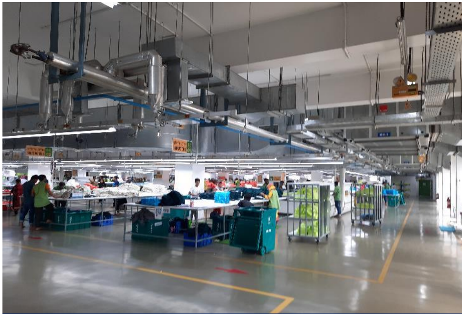
Over hanged non-structural elements