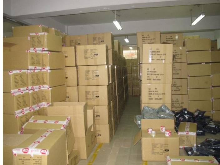
Uncontrolled heavy storage on ground and 4 th floor. (GF not a problem).