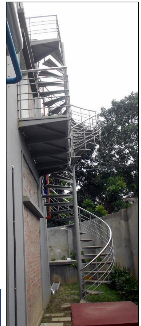
Spiral Steel stair on the south side

No drawing was available for the stair. The stairs do not have adequate bracing and the connection with the building appears to be poor. Building Engineer to carry out a design check of the steel stair with emphasis on bracing and connections, and to carry out the necessary remedial works if required.