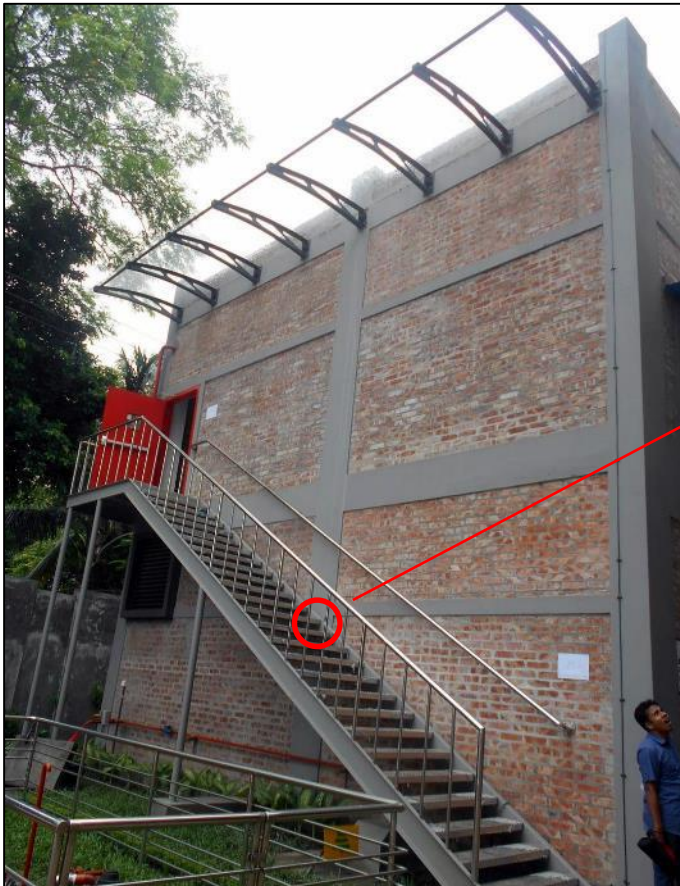
Steel stair on the north side