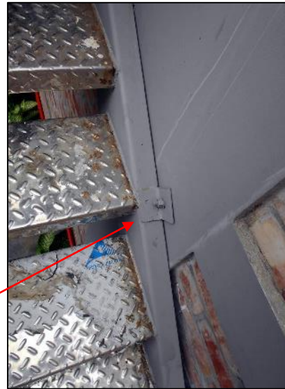
Connection with building wall

No drawing was available for the stair. The stairs do not have adequate bracing and the connection with the building appears to be poor. Building Engineer to carry out a design check of the steel stair with emphasis on bracing and connections, and to carry out the necessary remedial works if required.