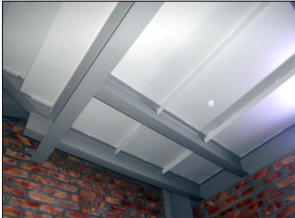
Cantilever slab on north side and stair landing details is not shown the drawing. As-built drawing is required to be updated.