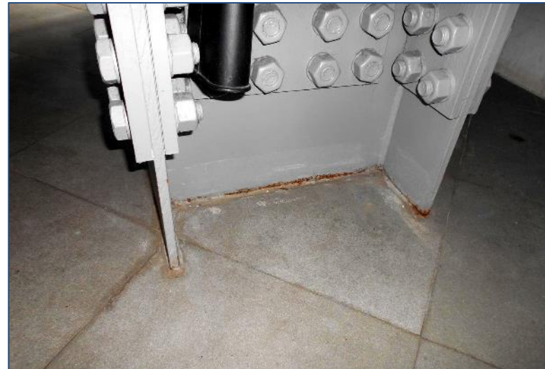
Corrosion found in column and bracing joint connection.