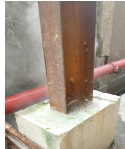
Corrosion at column