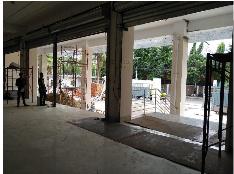
Ground floor column in loading-unloading bay