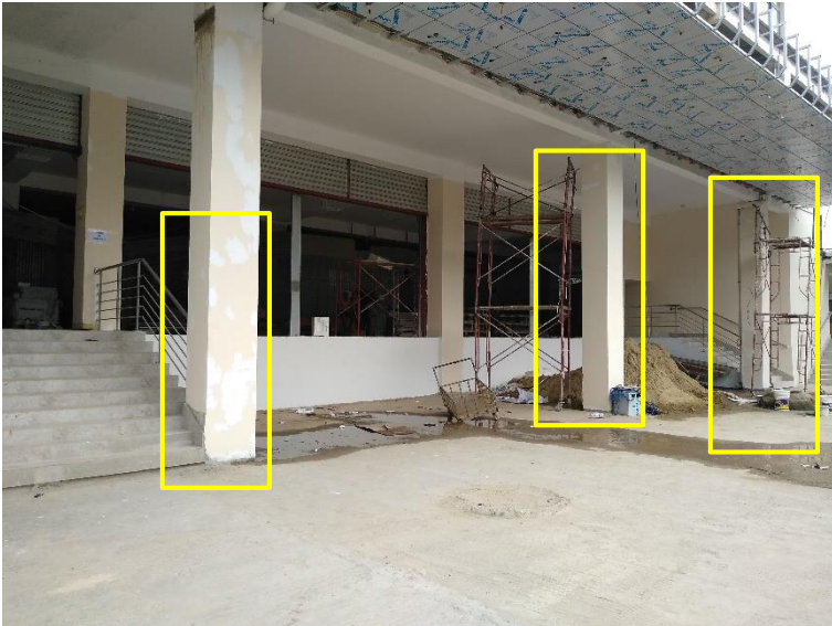
Columns at loading bay are susceptible to impact loading from vehicles.