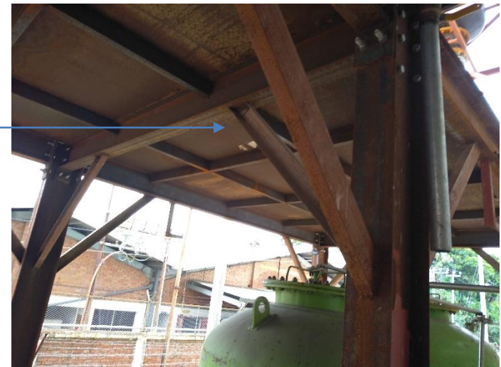
Corrosion at I-Joist & bracing