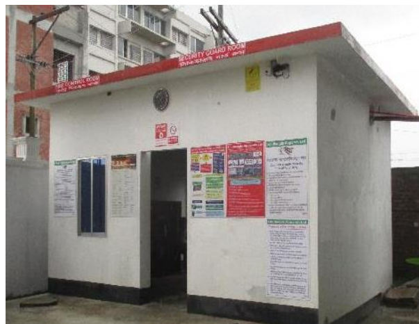
Fire Control Building