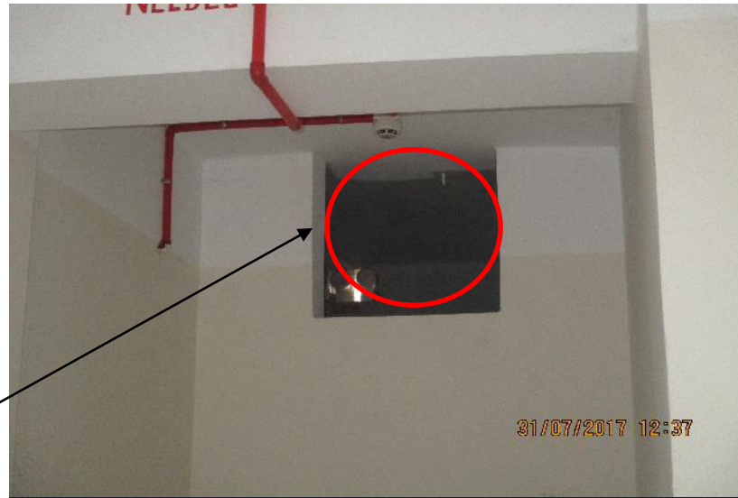
Secondary beam was not observed on east side toilet area on 1 st to 3 rd floor