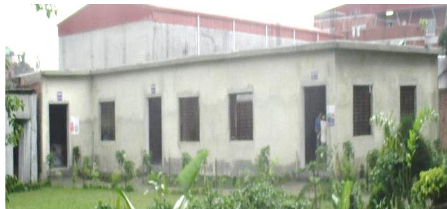
Dining & Wastage building