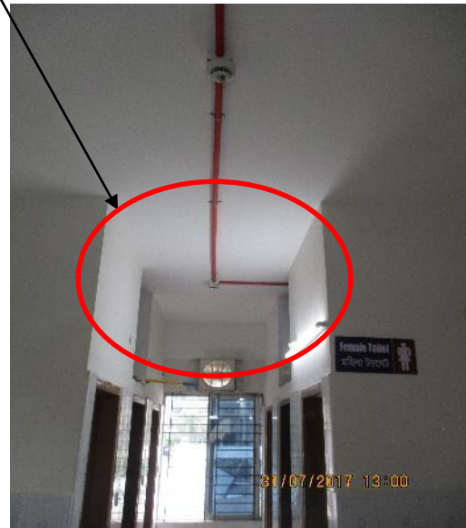
Secondary beam was not observed on east side toilet area