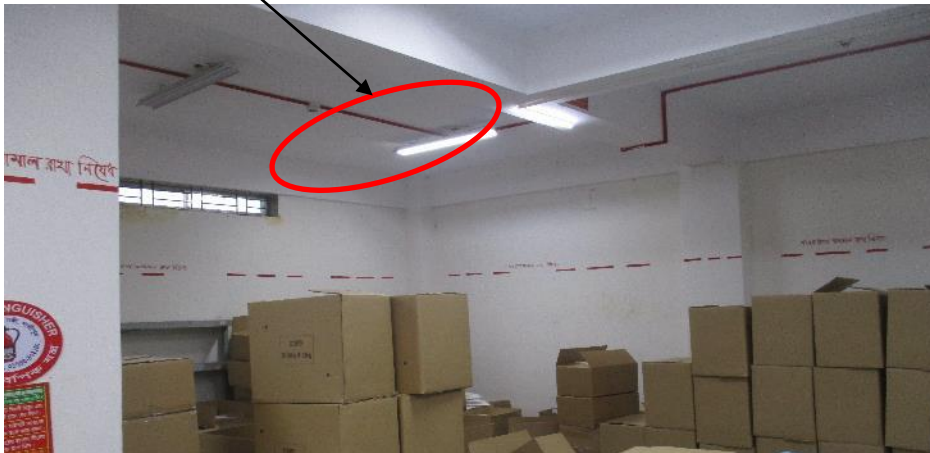
Secondary beam was not observed on south-west side in storage area