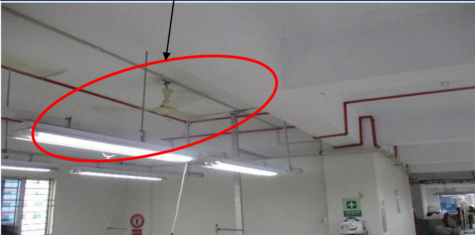
Secondary beam was not observed on south-west side on 1 st to 3 rd floor

Building Engineer required to prepare As –Built drawings reflecting the actual condition.