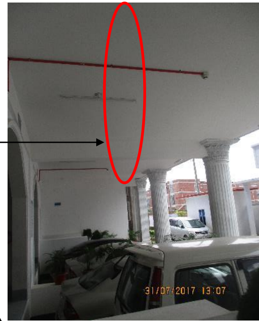
Secondary beam was not observed on east side loading/unloading area