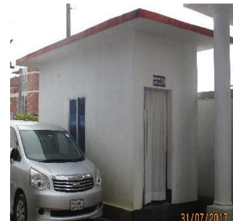
Security guard building

Factory could not provide any structural drawing for above these buildings. Building Engineer is required to produce a full set of as built drawing reflecting on site condition for those buildings.