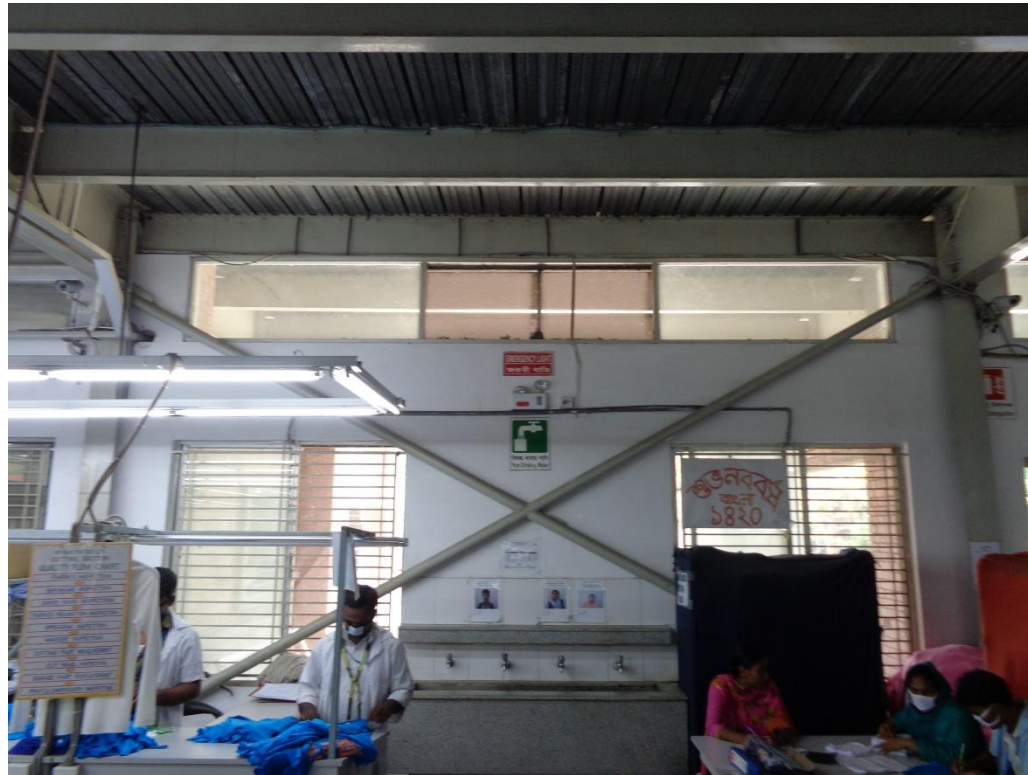
Lateral Restraint System

All R.C. buildings were constructed with beam/slab arrangements with no obvious means of lateral stability. Steel structures were noted to have at least a degree of steel cross-bracing.