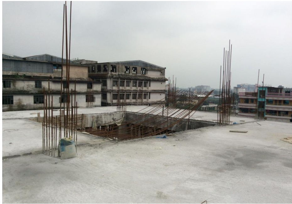
High strength rebar was observed in the column reinforcement at 4 rd floor