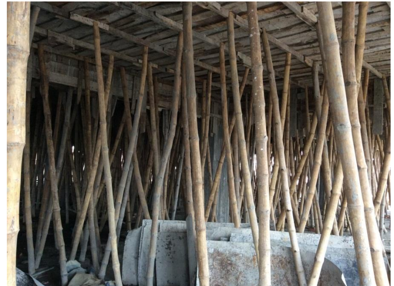
Areas of the 3 rd floor slab were still propped and had recently been cast