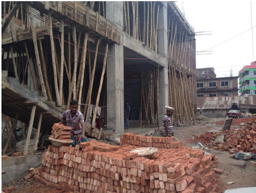
Peak Apparels was under construction at the time of survey. The RC frame had been constructed up to 4 th floor slab.