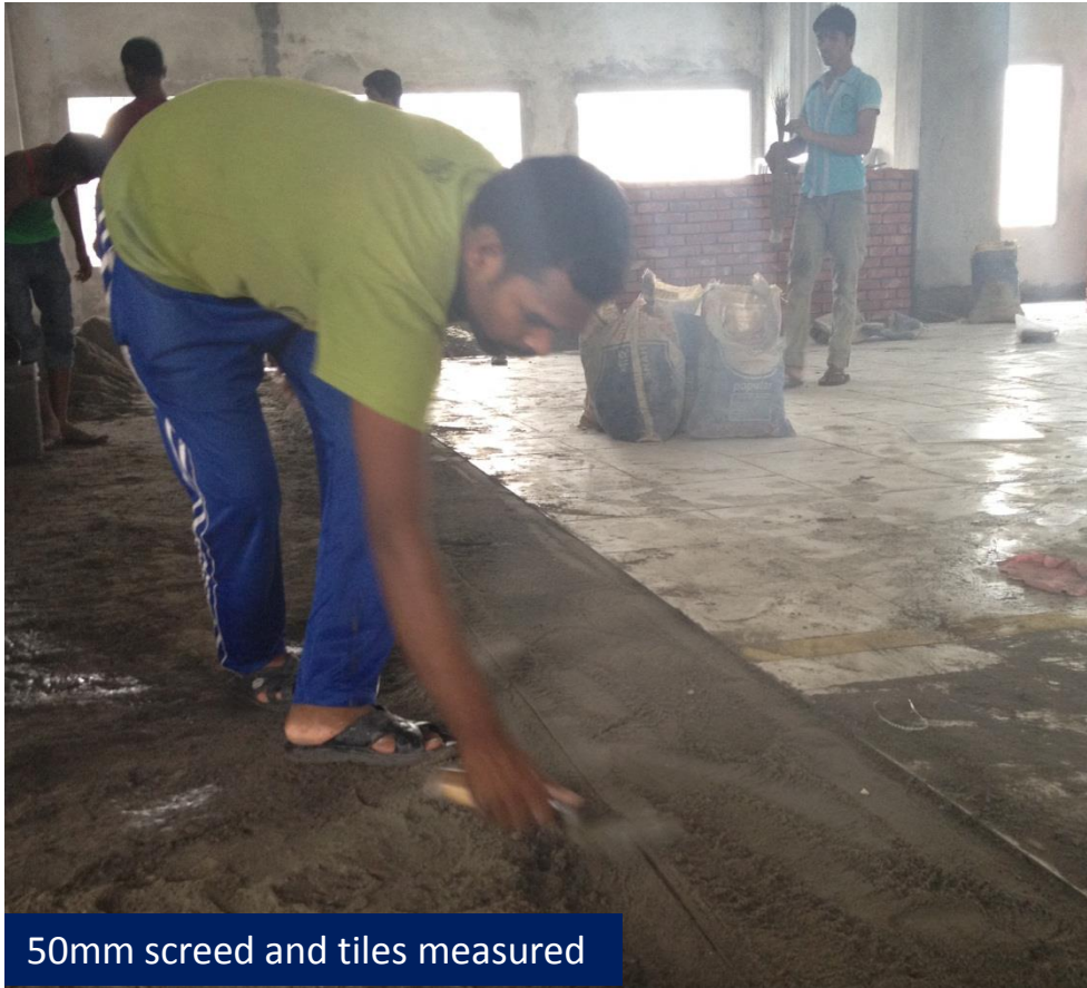
50mm screed and tiles measured

Building activities included installation of floor finishes and internal wall construction