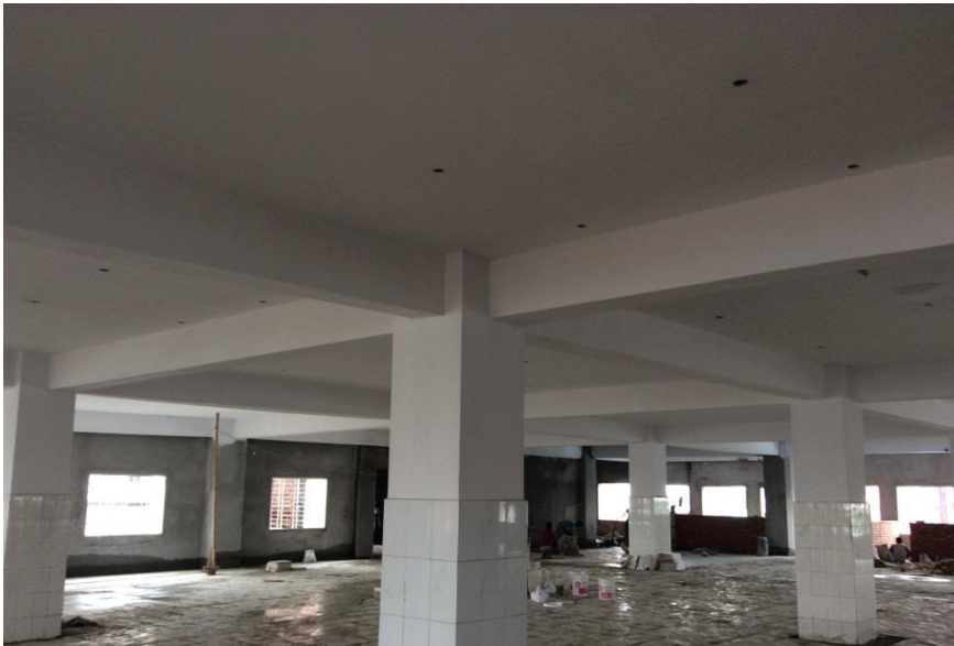
Lower floor concrete surfaces had already been plastered and finished