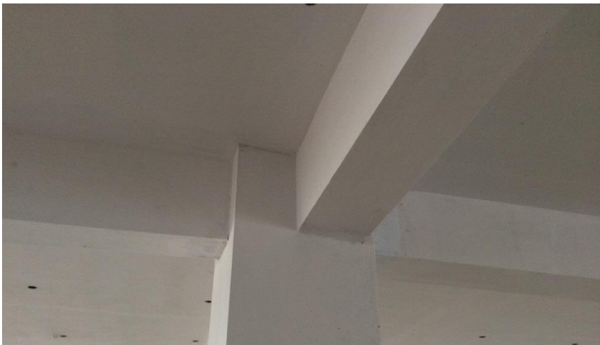
Eccentric beams were observed – the Project Engineer advised that eccentricities had been accounted for in column design